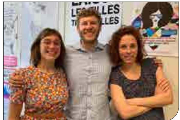
The Twinning and International Cooperation team

Would you like to know more about our activities, develop an exchange or solidarity project or apply for subsidies? Contact : jumelage@ixelles.brussels 02 515 69 37 of 38 ou 39